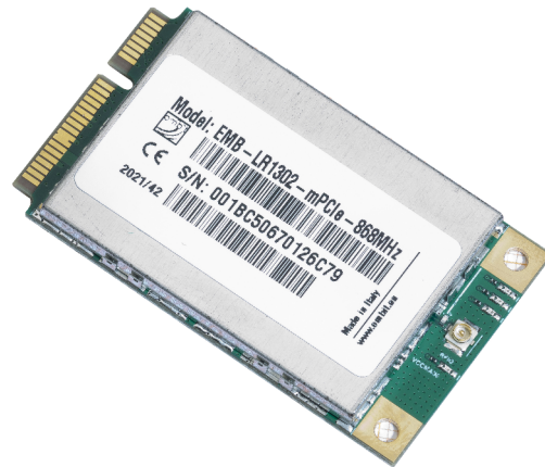
Figure 1. EMB-LR1302/3-mPCIe.

It offers up to 8 LoRa® channels in the 868 MHz (or 915 MHz) frequency allowing it to receive up to 64 LoRa® packets simultaneously. It is able to achieve a sensitivity of -140\text{dBm} and a RF output power of +27\text{dBm} making it the ideal device to use in LoRa® gateways applications. It supports two new spreading factors: SF5 and SF6. This enables users to reach higher data rate communication.